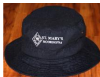
Navy Bucket Hat