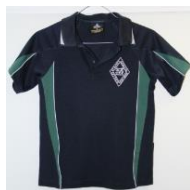
Navy Polo – long or short sleeve