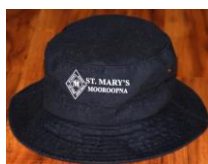
Navy Bucket Hat