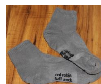
Grey Socks No brand names