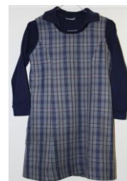
Pinafore with Navy Long Sleeve Polo or Skivvy & Navy Tights