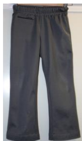
Grey Bootleg Pants / skort