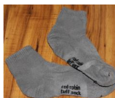
Plain Grey Sock No brand names