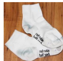
White Socks No brand names