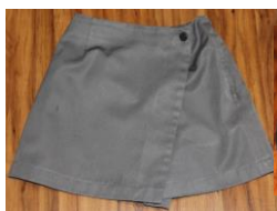
Grey Skort or unisex grey shorts