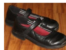
Black Shoes OR Plain black runner