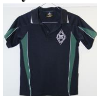
Navy Polo – short or long sleeve