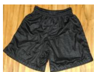
Summer - Plain Black short