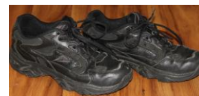
Black School Shoe OR Plain Black Runner