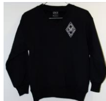
Navy V Neck Windcheater