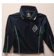
Long sleeve polo